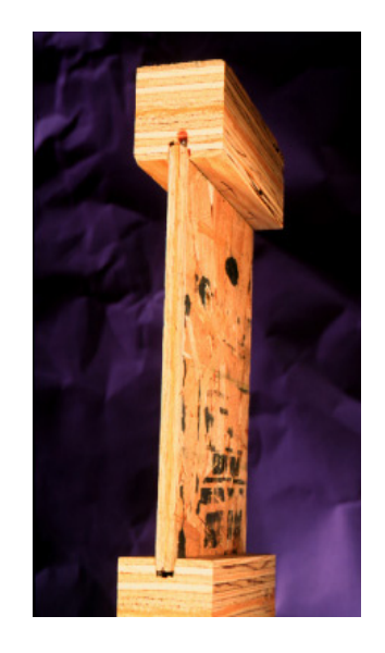
Wood I-joist with LVL flanges and OSB web material

As the text box on the following page discusses, the overall use of engineered wood products in the home building industry has increased rapidly in recent years. While part of this growth is due to product development and process improvements, the example of Laminated Veneer Lumber (LVL) highlights that the pathway from innovative materials to a market-accepted product can take many years and also is influenced by external factors such as the price of competing products and shifts in resource supplies.