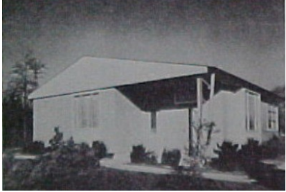
Metal house by Lustron Homes, circa 1940

Historically, manufacturers—in coordination with architects and builders—have driven the use of alternative basic materials, as evidenced by a series of World's Fair Houses and other demonstration homes through the mid-1900s. For example, at the 1933 Chicago World's Fair "Homes of Tomorrow" exhibition, Good Housekeeping and the Stran Steel Corporation demonstrated a house built primarily from iron and steel. The house was largely prefabricated, fireproof, and affordable to average Americans ($7,500).