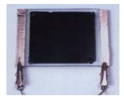
Electrochromic window in its darkened state