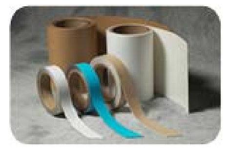
Structural Acrylic Pressure-Sensitive Adhesive Taping

widths can range from one-half inch to almost one foot. This provides enough coating area to establish secure bonds on uneven or irregular surfaces. Estimates of connection longevity are not readily available at this time. Pressuresensitive tapes for structural applications offer potential production benefits by reducing the number of required metal connections (i.e., screws, nails, and ties) necessary to retain structural integrity.