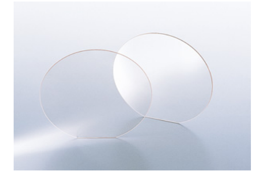
Transparent Ceramic Lens

Murata Manufacturing has developed a transparent ceramic product called LUMICERA. Casio uses the LUMICERA as a lens for some of their digital cameras in an attempt to find better ways to create smaller and thinner cameras. The use of transparent ceramics allows for a significant reduction in the profile of zoom lenses. Not only is the refractive index of the LUMICERA much greater than that of optical glass, it also offers superior strength. Through recommendations by Casio, the ceramic material has been refined for use in digital camera optical lenses by endowing it with improved transmission of short wavelength light and eliminating pores (air bubbles) that reduce transparency.