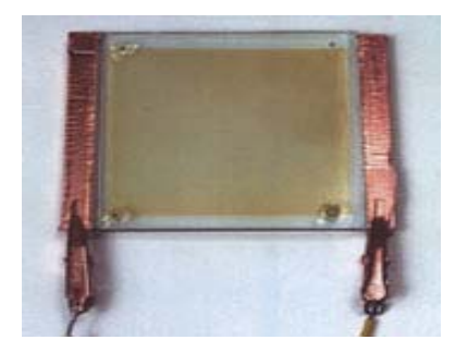
Electrochromic window in its lightened state

Electrochromic windows are windows that can be lightened or darkened electronically and can provide privacy, daylighting control, and heat-transmittal control. When a small voltage is applied to an electrochromic window, it causes the glass to darken, resulting in a window that may look anywhere from transparent to opaque or shaded in appearance. This allows the homeowner to control the amount of light that passes through their windows directly with the use of an electronic control, or indirectly through the use of an automatic switch that changes the window from light to dark based on the amount on sunlight it receives.