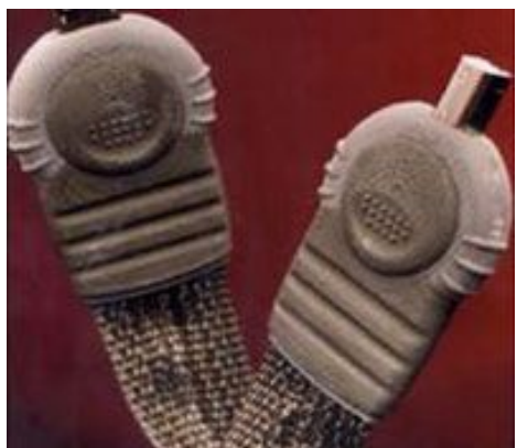
Electro-textile fabric with USB connectors

In the context of housing, the possibility exists to develop electro-textiles to the point where systems that depend on wiring can be taken out of the wall cavity and integrated into the surface of finish materials. For retrofit applications, electro-textiles could offer an alternative approach to providing new electrical and communications wiring. For example, wiring for new lighting or audio systems could be surface applied with an electro-textile as opposed to fishing new wiring through a wall cavity. Likewise, with integration into carpets or other materials, creative and flexible designs could be created that allow for the movement of