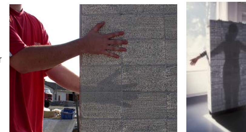
Light Transmitting Concrete Image Source: LiTraCon™ (www.litracon.hu)

A light-transmitting concrete product called LiTraCon<sup>™</sup> is currently under development and should be available for sale in prefabricated blocks by the end of 2005 (Graydon, 2004). Parallel glass fibers are embedded into the concrete to form a matrix that can display a view through wall panels to the outdoors. As shadows,