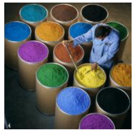
Vats of Heat-Reflecting Powders

Shepherd Color Company is the developer of the ARCTIC brand of infrared reflective pigments. The powdered pigments, which are designed to reduce temperatures on surfaces to which they are applied, can be added to paints, plastics, and other materials to give them a custom color. Unlike other products designed to reduce heat build-up, the color is not limited to white. According to the manufacturer, the ceramic pigments reflect infrared light and exhibit greater total solar reflectance than the same color made with conventional pigments. Thus, substances with the ceramic pigments are able to maintain lower temperatures than conventional surfaces.