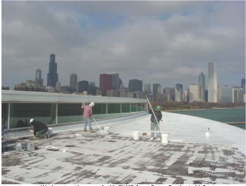
Workers coating a roof with ELMS from Green Products LLC

The resin system is formulated to provide significantly greater life and durability compared to elastomeric acrylic products. It can be applied by brush, roller, or spray applicator. The manufacturer makes the claim that it is 100 percent waterproof and, because of its excellent adhesion and flexibility, prevents UV-rays from drying and cracking underlying roofing material, which can add years to the life of a roof. The durability and energy-saving benefits of these roof coatings could lead to products that enhance the durability and energy performance of residential buildings.