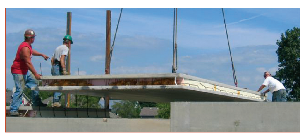
The erection crew positions a precast concrete floor panel with assistance from a crane.

The opinions expressed in this document represent those of the builder and do not necessarily reflect the views of PATH.